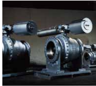
Steel Ball Valves, Trunnion Ball Design