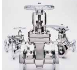
Duplex Stainless Steel Valves