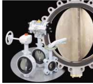
Ductile Iron Butterfly Valves